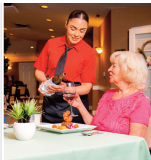
Skyview Dining Room

The Village offers meal plans that allow you to dine as you choose. On a monthly basis, you can choose meal plans for 7, 14, 21, or 30 meals per month or just go à la carte and pay as you dine. Whichever choice you make, our Chef provides an ever changing menu that is sure to please. Of course, you can always choose to enjoy a meal out at area restaurants or dine-in on takeout or a home cooked meal from your own recipe book – the choice is yours!